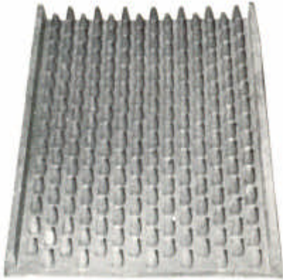
Exclusive nubbed CamBelt conveyor belt gives high incline capability. Model 1210 (shown) has one-inch-high-nubs and flanges.