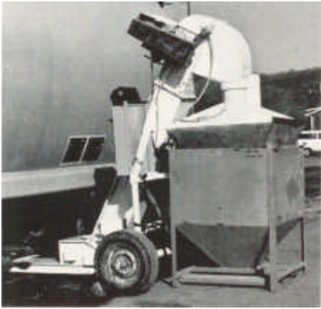
Model 1210 Portable Railcar Unloader unloading talc from railcar to be used in manufacture of roofing shingles. Replaces conventional bag handling operation.