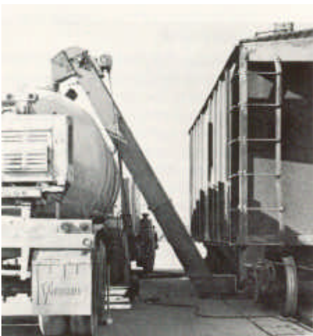
Low profile inlet positions between rail and discharge port. Swivel wheels and castors provide for lateral movement beneath car.