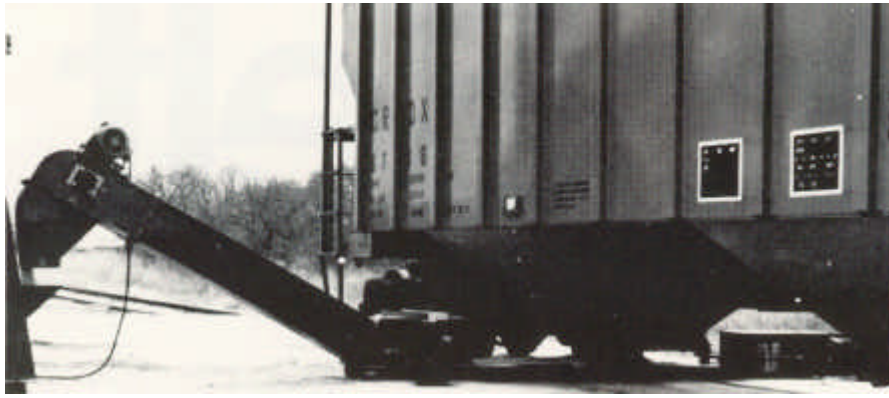
Model 1210 Cambelt Portable Railcar Unloader transferring material from railcar to bucket elevator inlet hopper.