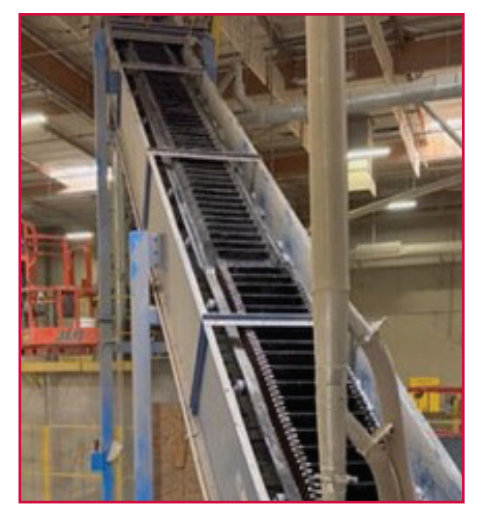
When you have limited space and need to move material up at steep angles, CAMBELT is the GOLD STANDARD!

"The Cambelt conveyor we installed in 2022 has put our company in the number one position above the competition. We are able to win jobs that we used to lose"